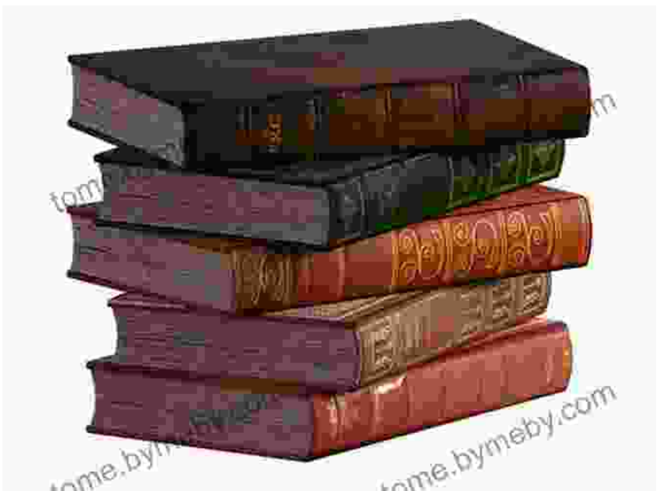
A stack of books, including "No One Asked For This: Essays"