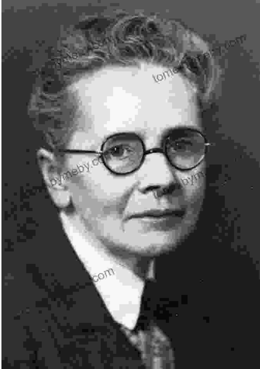
Julia Morgan, pioneering female architect

In the annals of architectural history, the name Julia Morgan shines brightly, illuminating a path of groundbreaking achievements and unwavering determination. As the first woman to receive a degree in architecture from the prestigious École des Beaux-Arts in Paris, Morgan shattered glass